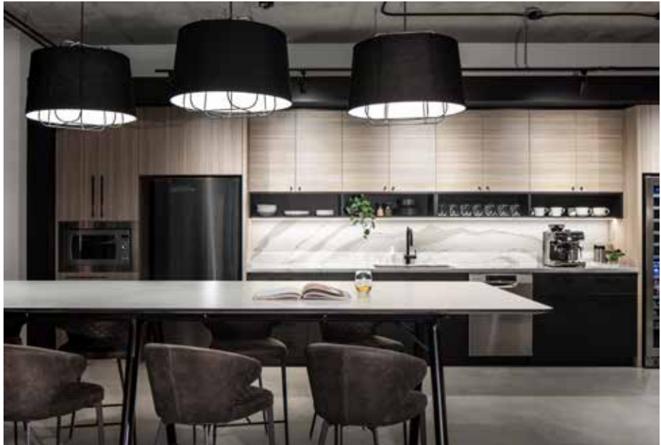
Horizontal and vertical surfaces can have different performance needs that can require consideration of a range of surface materials.

to the same rigors of wear use, hence they can often be covered with a less durable material quite satisfactorily. The exception is in buildings where vertical walls or corners are subject to damage from the passage or transport of equipment, carts, luggage, etc. In those cases, selected areas may need to be reinforced and protected.